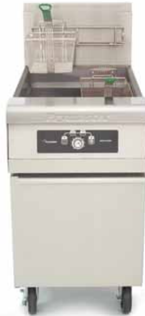
Shown with optional castors

This 158.3mj model is specifically designed for high production of chicken, fish and other breaded products. The exclusive 1° action thermostat (two-year limited warranty) anticipates rapid rate of temperature rise, reducing temperature overshoot, extending shortening life and producing a more uniformly-cooked product. Centerline thermostat mounting permits quick sensing of cold food placed in either basket.